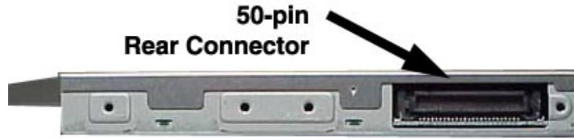
Figure 1. SD-R2212 DVD Writeable Drive Rear Panel – Connector

ATAPI Connector A 50-pin ATAPI interface connector is found at the rear of the SD-R2212 CD-RW/DVD-ROM Combo drive. Connecting cable should use Japan Aviation Electronics Industry Limited KX14-50Series L or equivalent connector.